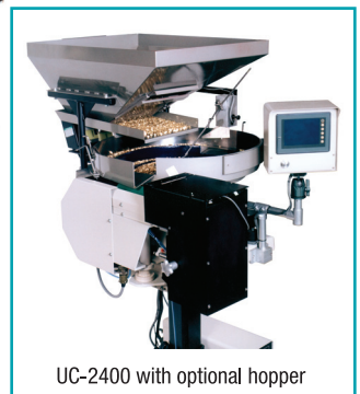
UC-2400 with optional hopper